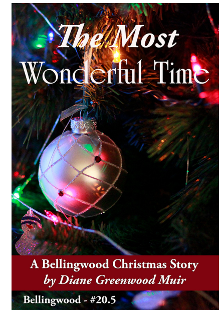
Book 20.5 - The Most Wonderful Time Release Date: January 1, 2018